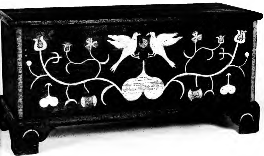
Chest by Johannes Spittler; yellow pine; Shenandoah Co., Va.; 1800–1810. HOA 32 \frac{3}{4} ”; WOA 49 \frac{1}{4} ”; DOA 21 \frac{3}{4} ”. Private collection.